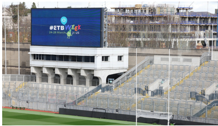
ETB Excellence Awards 2025, Croke Park