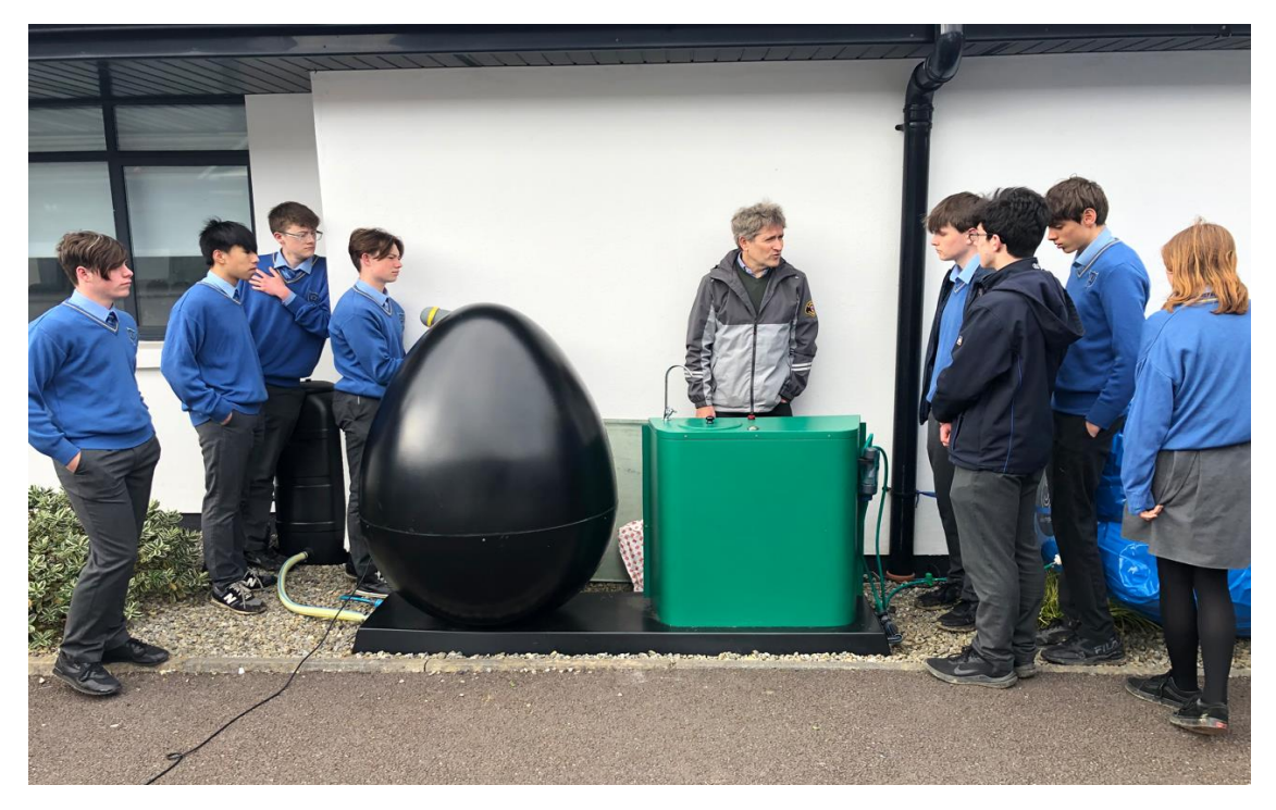
Above: Students of Kinsale Community School with the MyGug Biodigester.