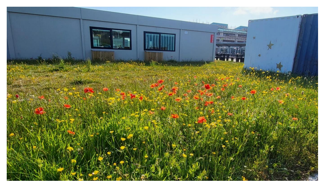
Above: The wildflower meadow at Stepaside Educate Together.

We have promoted nature education by conducting wildflower, insect, and tree surveys. We have brought in a range of speakers who are masters in their field including an ecologist an organic farmer, and a nature photographer, and we even had a dedicated Bio-diversity day. We are working on engaging more with the community by creating a parents' garden."