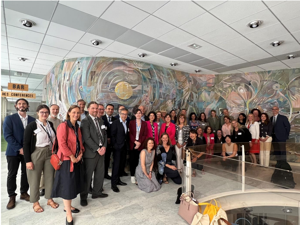
Above: ESD Net Europe and North America participants – June 2023, UN Offices, Paris.