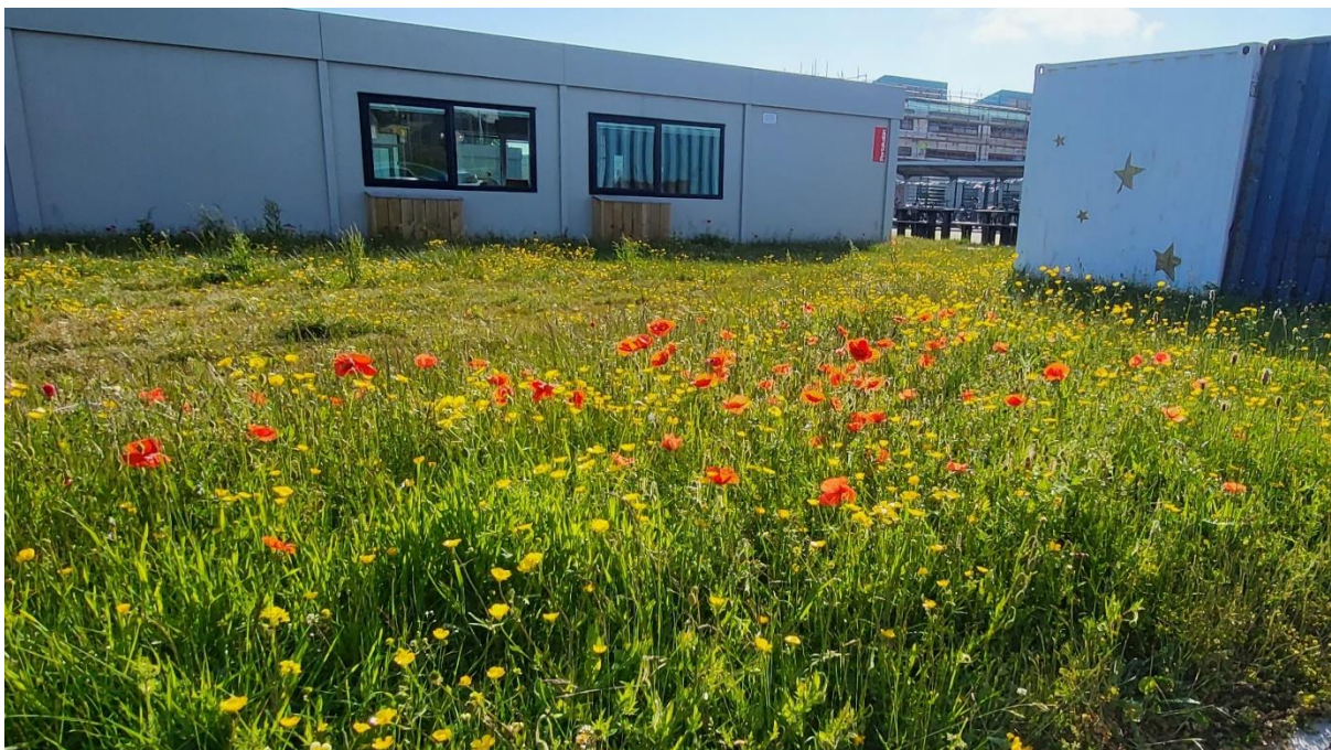
Above: The wildflower meadow at Stepside Educate Together.

We have promoted nature education by conducting wildflower, insect, and tree surveys. We have brought in a range of speakers who are masters in their field including an ecologist an organic farmer, and a nature photographer, and we even had a dedicated Bio-diversity day. We are working on engaging more with the community by creating a parents' garden.”