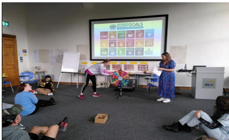
Above: Spinning the Wheel of Sustainable Development Goals at the Global Village Summer Course.

Global Village is the strategic partnerships for Global Citizenship Education in primary schools in Ireland, between Irish Aid at the Department of Foreign Affairs and a consortium of four partners: Dublin City University (DCU), Irish National Teachers' Organisation (INTO), Irish Primary Principals' Network (IPPN) and Trócaire.