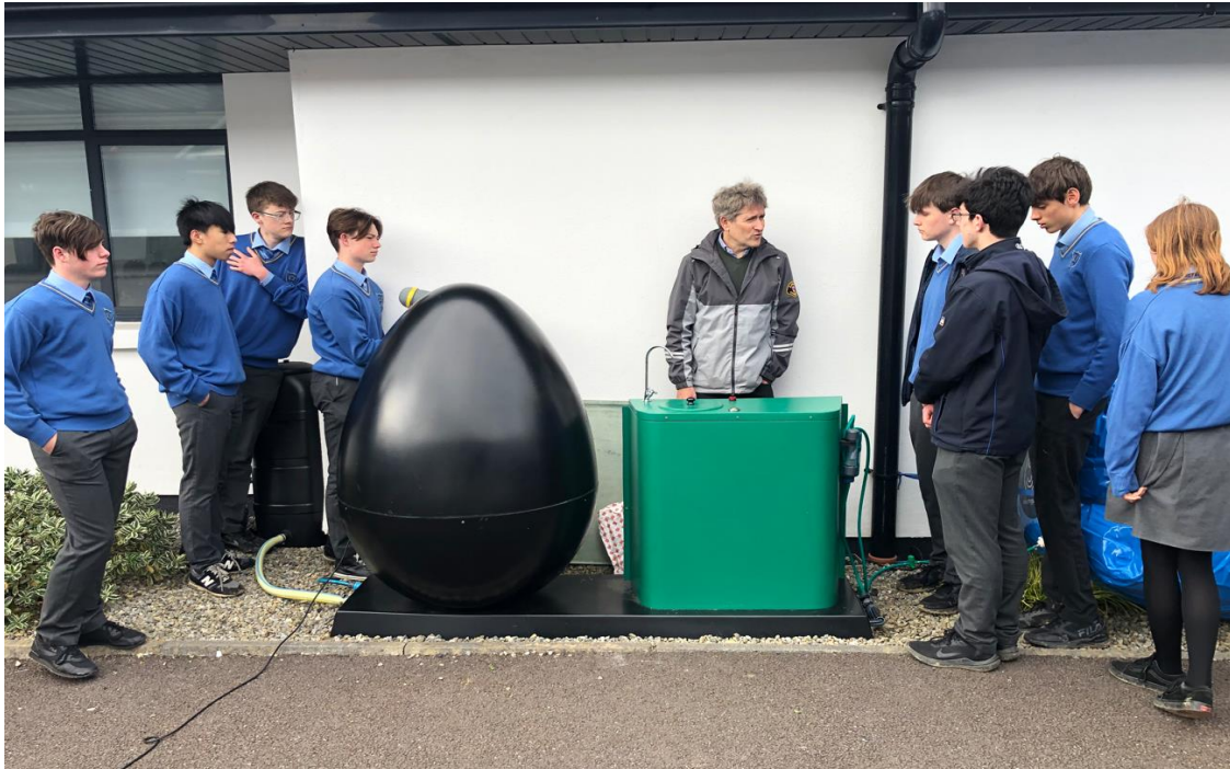
Above: Students of Kinsale Community School with the MyGug Biodigester.