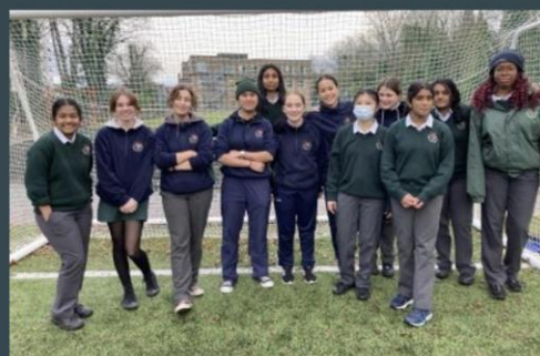
Above: A montage by students at St. Aloysius at their soccer competition.

ESD Newsletter is delighted to announce that St. Aloysius win a €500 One-For-All Voucher towards ESD projects for their input to the September issue of the ESD Newsletter. Congratulations!