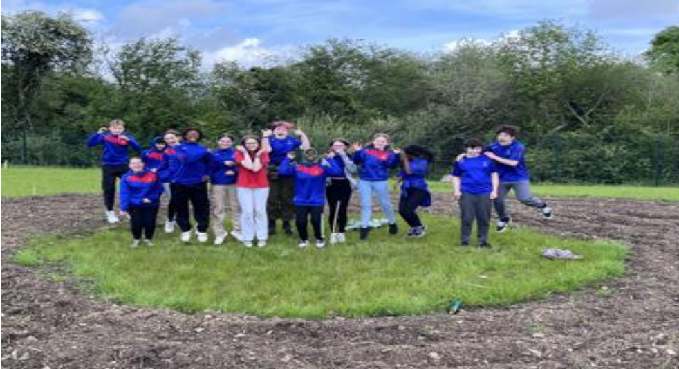
Above: Students at Celbridge Community School planting saplings.

ESD Newsletter is delighted to announce that Celbridge Community School win a €500 One-For-All Voucher towards ESD projects for their input to the September issue of the ESD Newsletter. Congratulations!