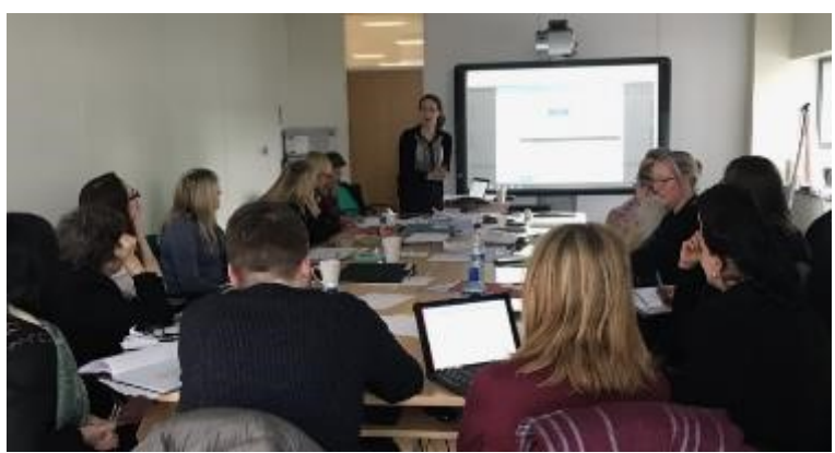
Image 1. DDL Training