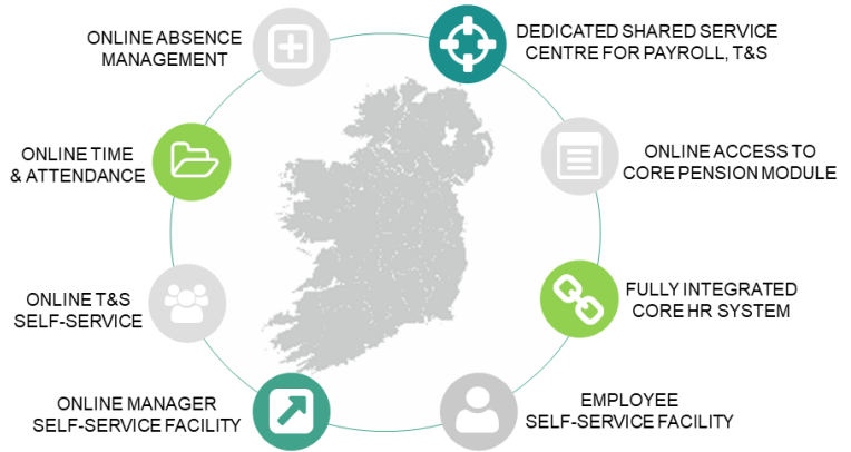
Image 1 – ESBS Benefits